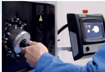
Die sets can be installed into the master dies with a QuickChange-tool one set at a time.