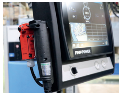
Remote control unit as a standard feature.